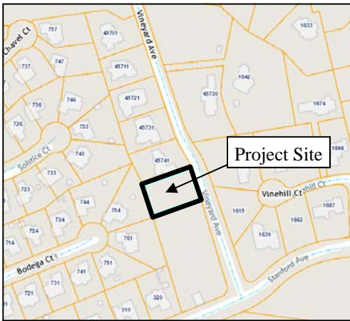
NORTH LOCATIONAL MAP

ADDRESS CHRONOLOGY • At time of original development, address assignment for TR 6704: 10/12/1996 (ME) • Verification of 45751 Vineyard Ave: 7/7/2017 (RW)